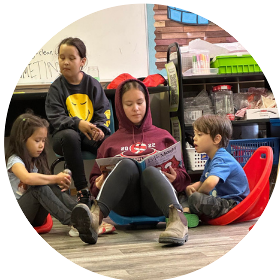
Reading Circle in Makkovik, Newfoundland and Labrador