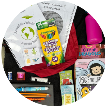
Learning kit from Alberta