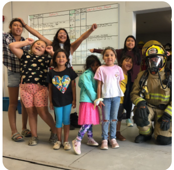
Learning together with firefighter guest speaker in Kenora, Northern Ontario