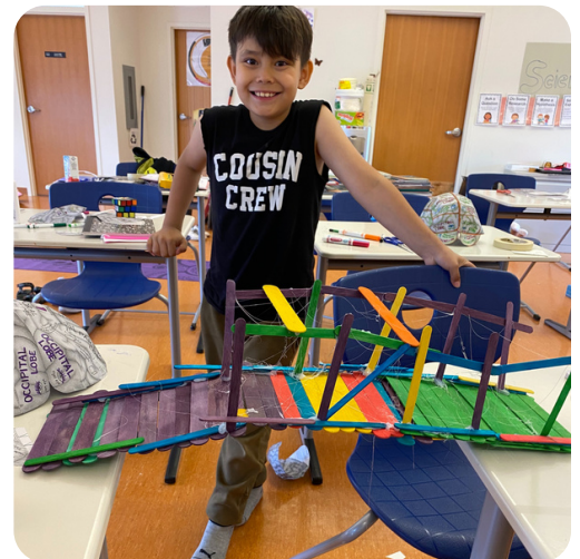
Bridge building in Wet'suwet'en First Nation, British Columbia

"My favourite thing about camp was making slime, and my least favourite thing about camp is that we have to leave!"