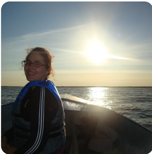
Enjoying the view!

In this past year I was at a crossroads with where I wanted my career to go. I had opened my own business of a indigenous pop-up bookshop but needed something more and I happen to stumbled upon a job at United for Literacy. It was perfect, working with literacy and supporting indigenous people across the country... Being able to work in the organization that helped create a strong foundation for my career after a decade is a dream come true. I am so grateful for all of my experiences with this organization and how my first summer job with them has had such a powerful ripple effect in my life."