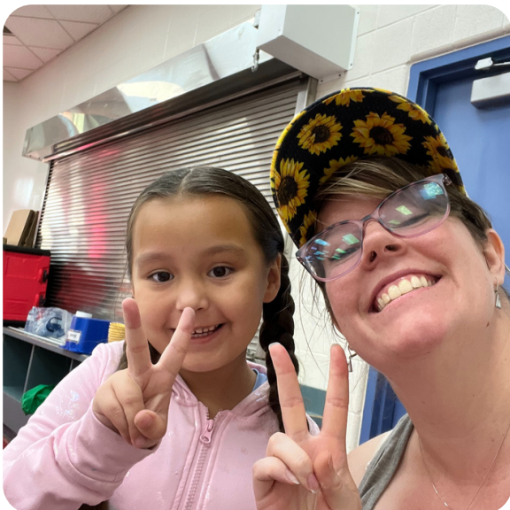
Camper and counsellor selfie from Samson Cree Nation, Alberta

Thanks to United for Literacy, we were able to have a robust camp that offered the campers something of interest for each camper and we are so thankful for the opportunity to have this right in our own community."