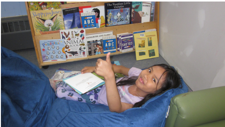
Camper enjoying a book in Marten Falls First Nation, Ontario