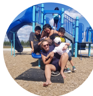
Playground fun in Kitchenuhmaykoosib Inninuwug/ Big Trout Lake First Nation, Ontario

“I love this camp, it’s full of positivity. My daughter had a rough year in her grade 1 class. She started hating school, but ever since she came to this day camp she can’t wait to go back to school.”