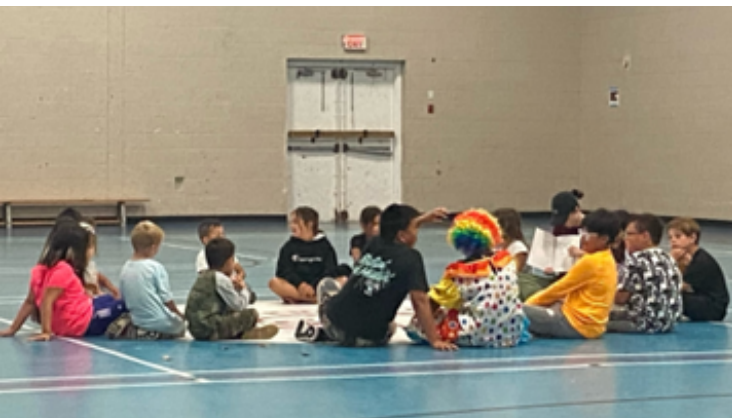
Campers reading a group story, Sipekne'katik First Nation, Nova Scotia

These activities not only taught campers new skills, but complimented the local community's culturally relevant summer activities in meaningful ways.