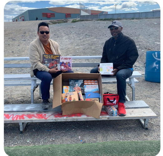
Counsellors preparing for camp in Rankin Inlet, Nunavut