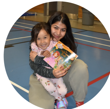
Books and bonding in Umiujaq, Nunavik

Across Canada, Summer Literacy Camps took many forms. The three camp models were: