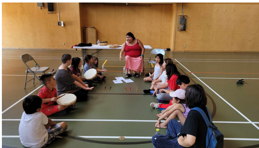
Stellat'en First Nation, British Columbia, community guest teaching the campers how to play the traditional game, Lahal

This transition took place this year in several communities in British Columbia. We have run camps across British Columbia for more than 10 years. This year, Wet'suwet'en First Nation and Saik'uz First Nation with the support of Carrier Sekani Family Services (CSFS) ran camps on their own for the first time. United for Literacy offered training to staff at CSFS and offered supplies to run the camp. We have heard from partner communities that it was the presence of United for Literacy in their communities for so many years that allowed them to develop the capacity they needed to sustain camps on their own—now and in the future. We couldn't be happier for our friends in British Columbia!