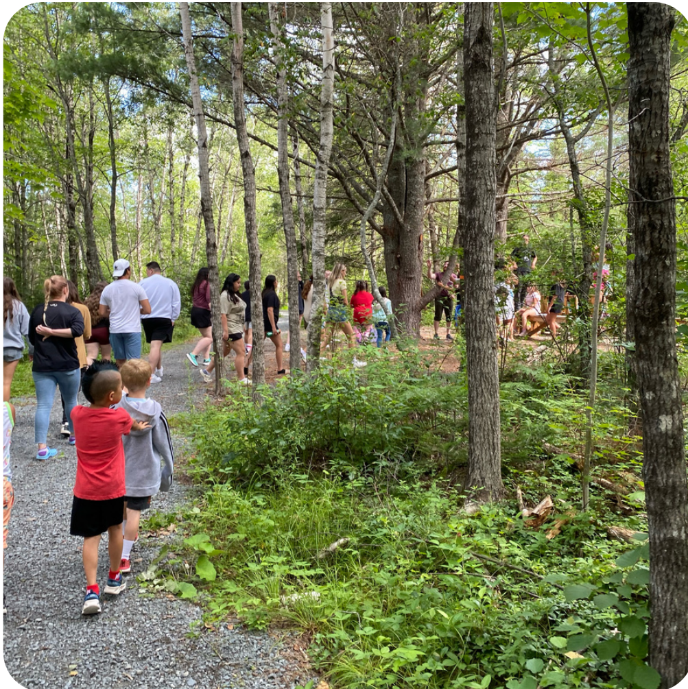
Learners heading on a walk in Sipekne'katik First Nation, Nova Scotia