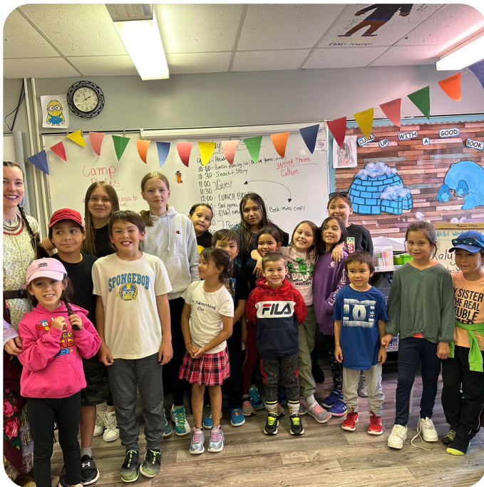
Smiles all around in Makkovik, Newfoundland and Labrador!