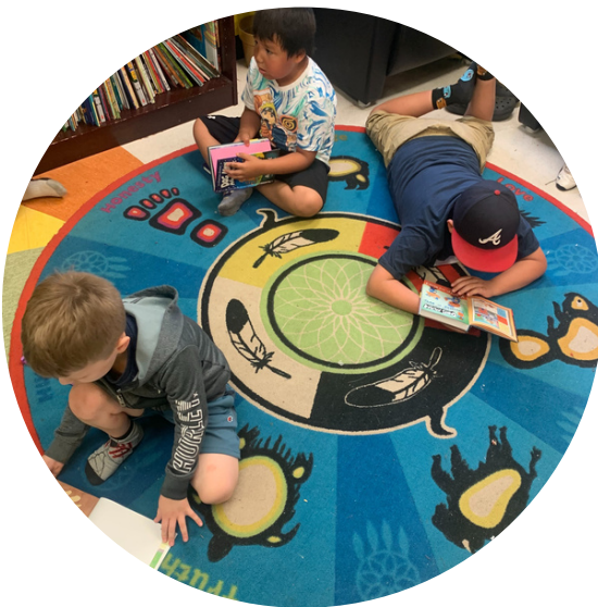
Reading break in Fort McKay First Nation, Alberta

"I'd like to be a counsellor here one day." — Camper, Ivukivik, Nunavik