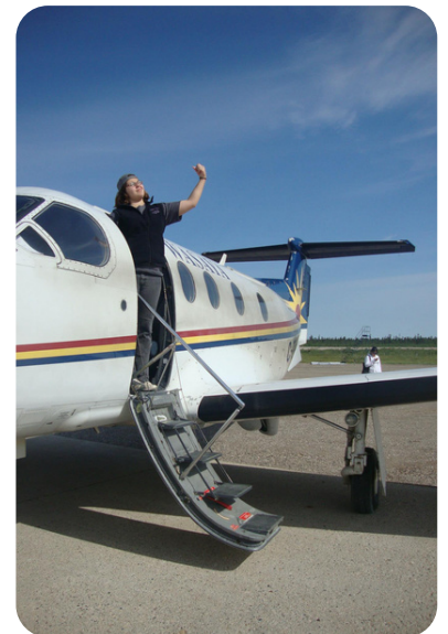
Arriving in Northern Ontario

"In 2012 I had the opportunity to be a camp counsellor for the Literacy Summer Camps in Bearskin Lake First Nation and Fort Severn First Nation . It was an experience of a lifetime! I decided to apply for the position because I was taking Indigenous Studies (then Native Studies) in university, knowing I was going to be switching over to a Mental Health diploma program in the fall. I wanted to know what it was like on fly-in reserves in Ontario and understand the full scope of barriers facing many different people. While I was in these communities I had a great time, meeting people, running literacy camps and enjoying the sceneries of the land. I was able to explore culture, and was able to make connections that I still have today. I used my love for literacy and this experience for a decade in mental health work settings and was able to help many people who had made the transition into urban life.