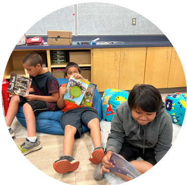
Reading time in Sturgeon Lake First Nation, Saskatchewan

This summer, we had the privilege to be the literacy partner of choice for 81 communities to provide safe, fun, and foundational literacy programming and materials to 3,678 local children aged 5-12 .