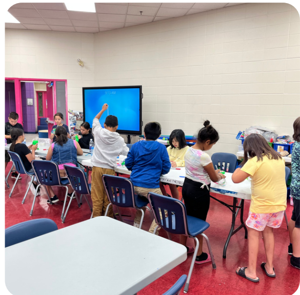
Crafting together in Samson Cree Nation, Alberta