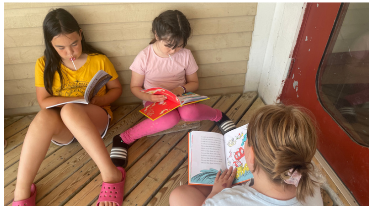
Campers enjoying outdoor reading time in Rigolet, Newfoundland and Labrador