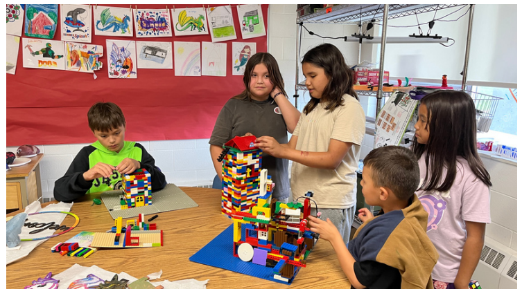
Lego building fun in Grouard, Alberta