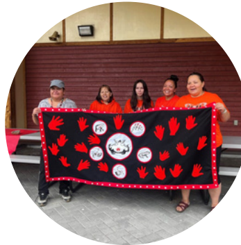
Nadleh Whut'en Staff with their camp-created button blanket.