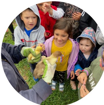
Meeting ducklings during a field trip in Peavine Metis Settlement, Alberta