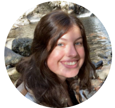
Camp counsellor from Bilijk First Nation, New Brunswick

Here is what camp staff working across Canada said about their experiences: