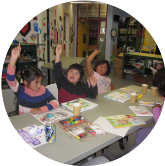
Painting together in Marten Falls First Nation, Ontario

The day-to-day experience of running a busy camp builds a range of broadly applicable skills, from communication to time management. These skills benefit counsellors in their future opportunities and give them tools to meet the needs of their communities. Best of all, local hiring provides a platform for youth to act as role models!