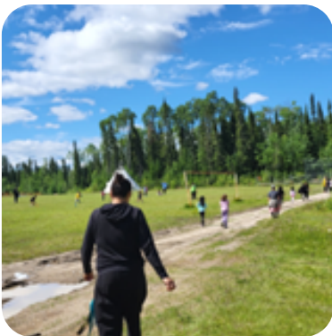
Camp nature walk