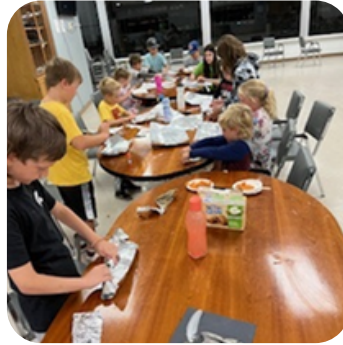
Fun with science activities