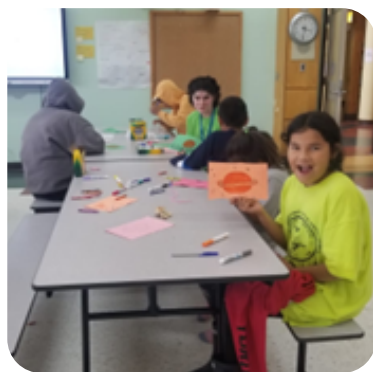
Campers crafting "space landers"

Some of our community-based activities included: