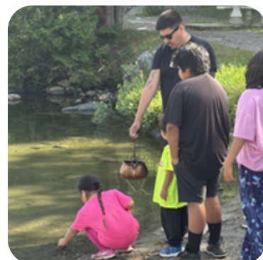
Campers enjoying the water walk

Camp counsellors work closely with community members to organize cultural learning opportunities for learners. In this picture, campers joined in on a water walk from Crow Lake to Lake of The Woods, hearing stories about local lakes.