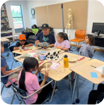
Sharing stories and camp activities

United for Literacy was proud to support learners in 25 communities through a range of enriching summer learning activities as well as book and learning kit distributions.