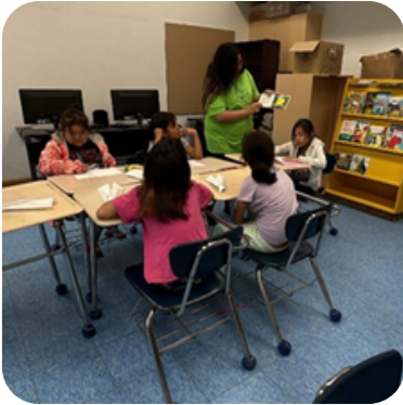
Campers reading together