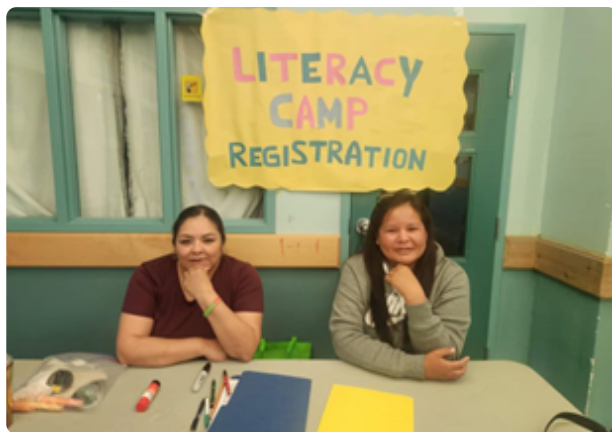
Camp staff setting up camp registration booth

The commitment and dedication that counsellors show is nothing short of inspiring. One of our counsellors in Onigaming First Nation has been working with Summer Literacy Camps for 10 consecutive years! This summer in Ontario, United for Literacy recruited and trained 27 local camp counsellors and 13 visiting counsellors.