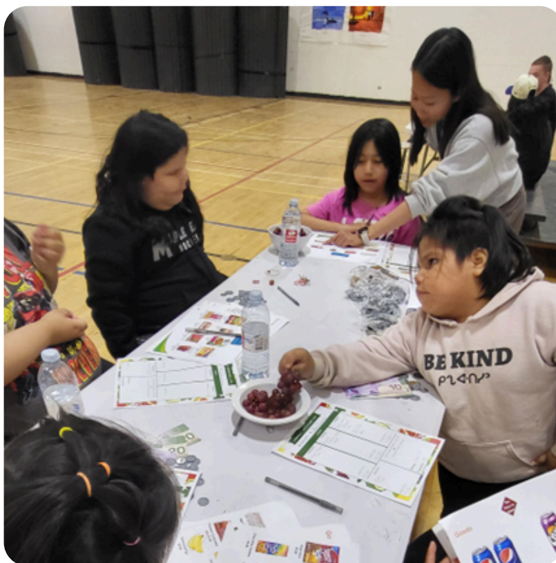
Financial Literacy Workshop for Campers and their families