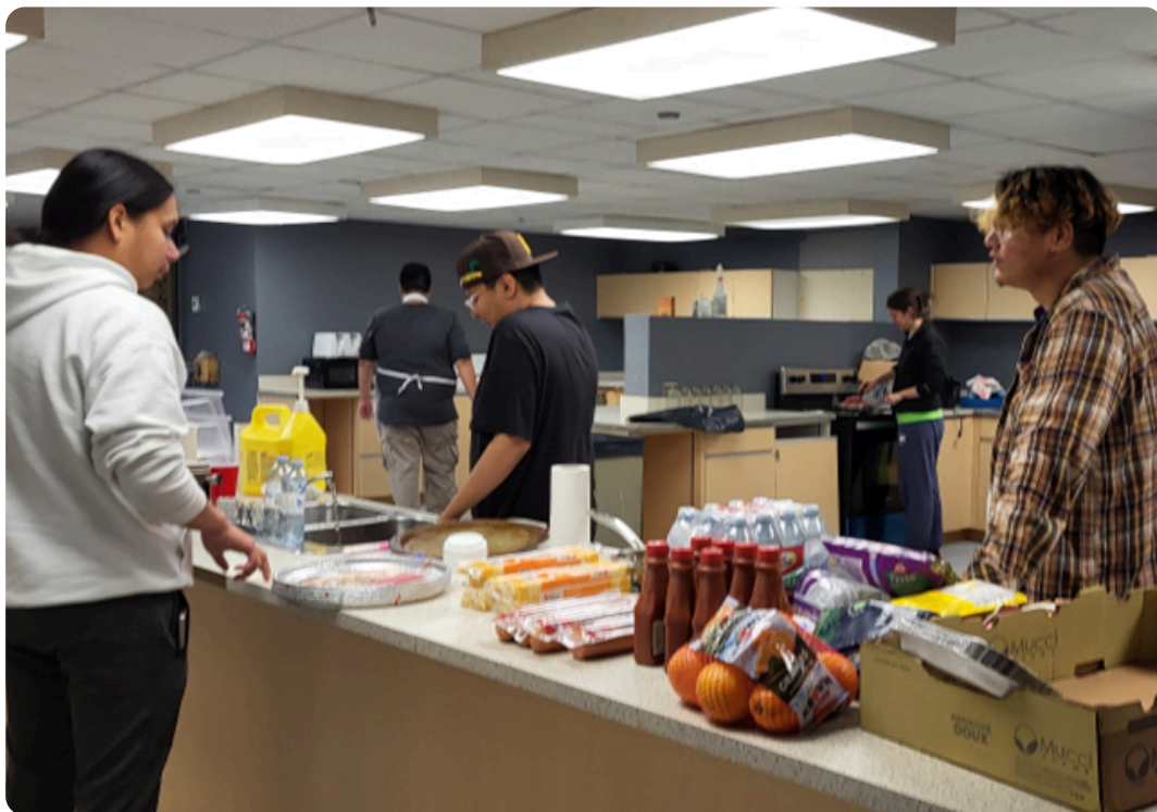
Prepping pizza for community workshop participants

Beyond the financial literacy component, this program also gave participants a chance to connect with one another and with United for Literacy staff and counsellors. After the workshop, staff, counsellors, and parents all worked together to prepare and enjoy a pizza supper!