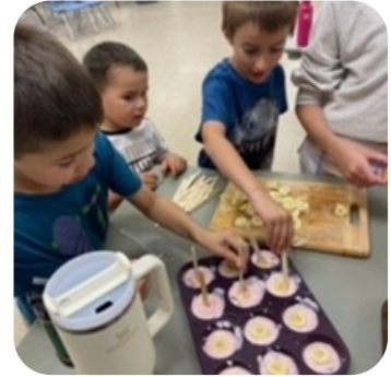
Campers making a healthy snack