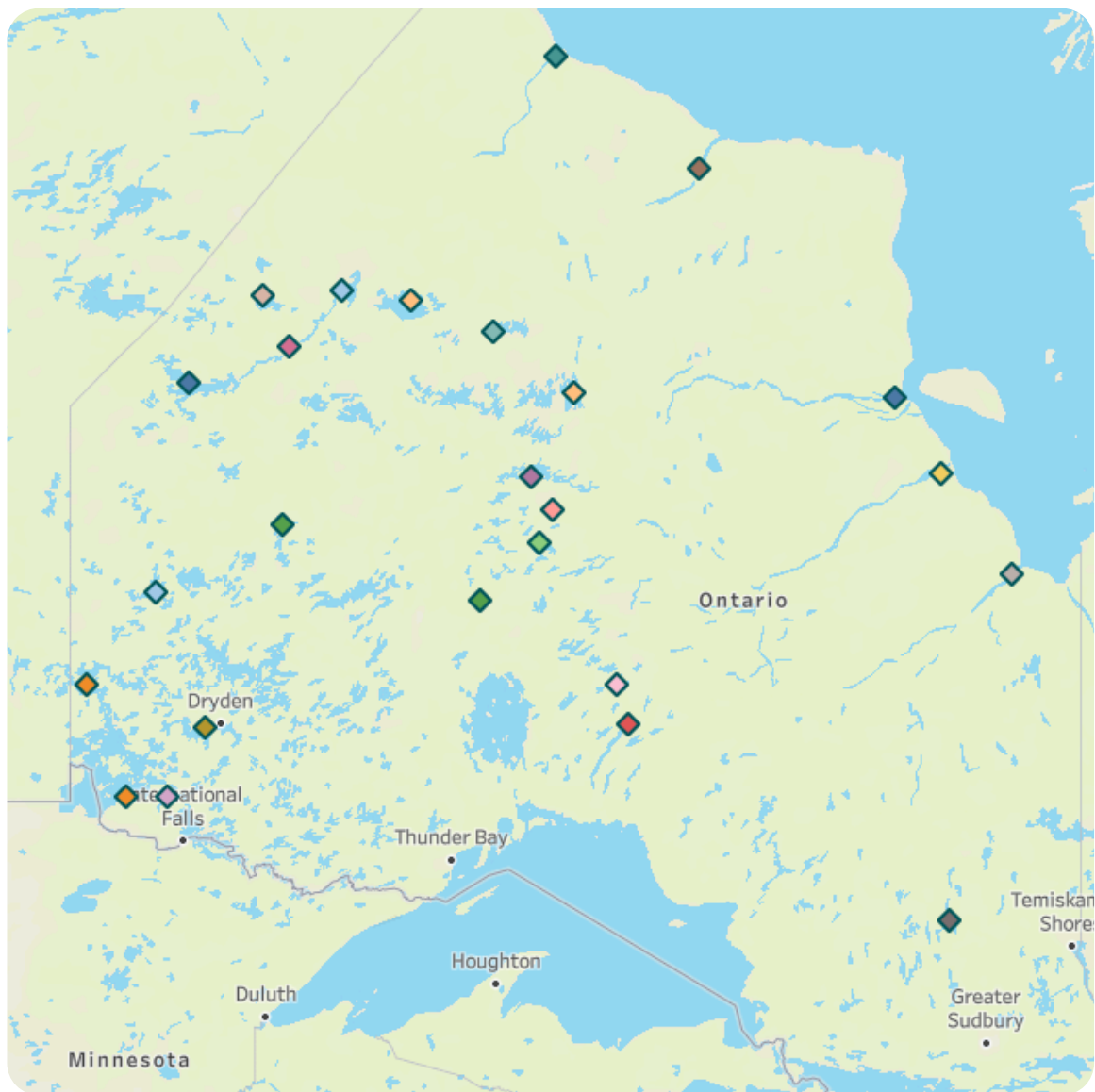
Summer Literacy Camp locations across Ontario

This year, we were proud and honoured to work with 25 communities in Northern Ontario including: